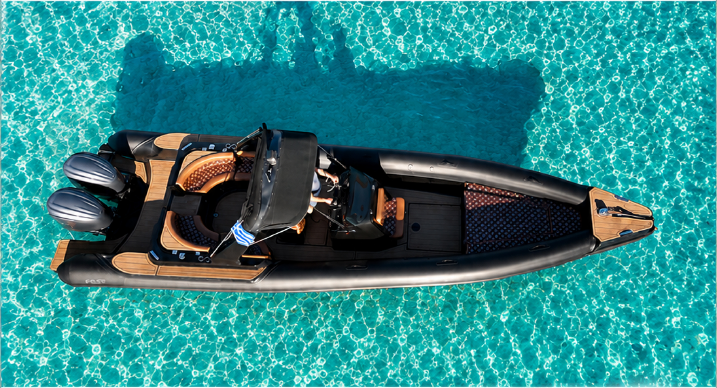
38ft Black Rib Speedboat – Twin Yamaha 300HP